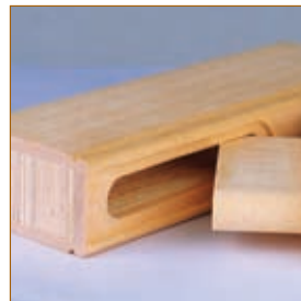
Engineered Stiles and Mortise-and-Tenon Joinery